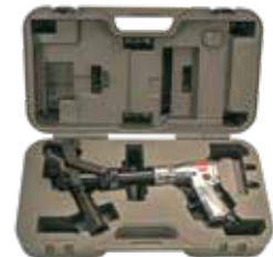
Includes storage case